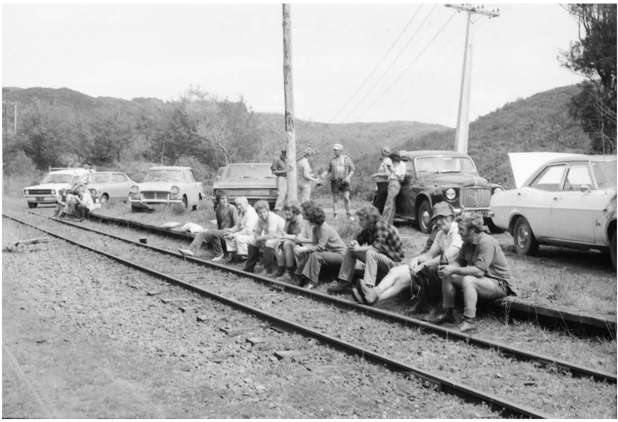
BTC members visit Pukemiro Junction for the first time in the early 1970's....