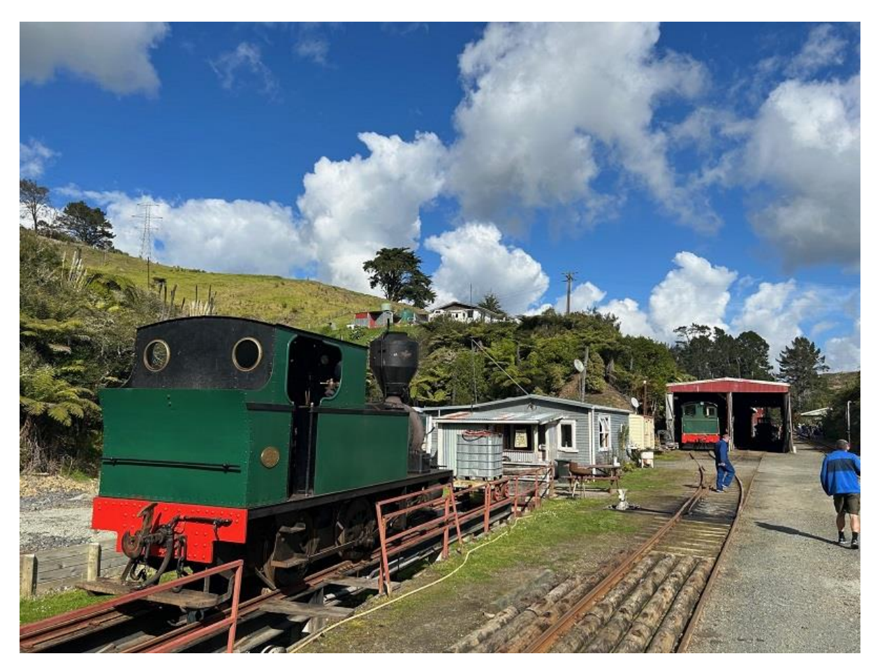
Peckett on the pit at the August Open Day