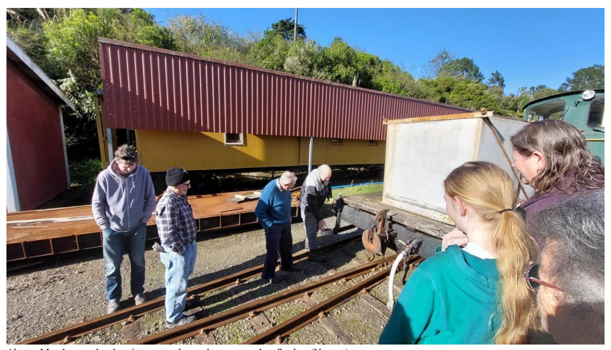
Above: Members at the shunting course learn about wagon handbrakes (Nampu).