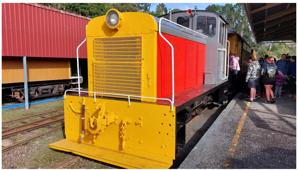
Tr459 at the August Open Day

August Open Day: This can only be described as probably our busiest day ever in the Club's history. We carried 1053 passengers!! For the first time since the long ago days when we had the Heisler & F185 running, we had to use 3 carriages on our trains. This meant that a diesel loco had to stay on the train & help push the train up the hills. The diesel loco in use was Tr 459. It was built by A & G Price in the 1960s so would never have been used on passenger trains before coming to our railway.