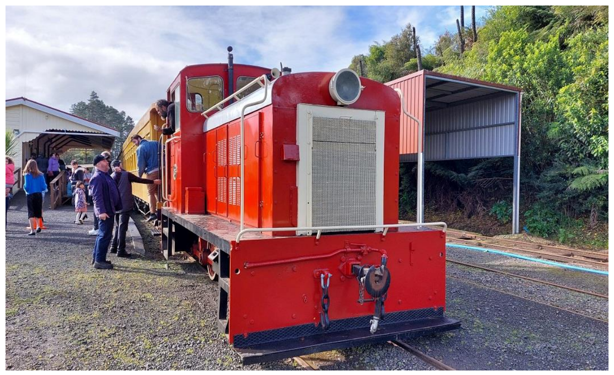
Tr105 at the July Open Day. Built by A&G Price of Thames in 1956

Many thanks to all who turn up & help make these days a success. You are certainly needed.