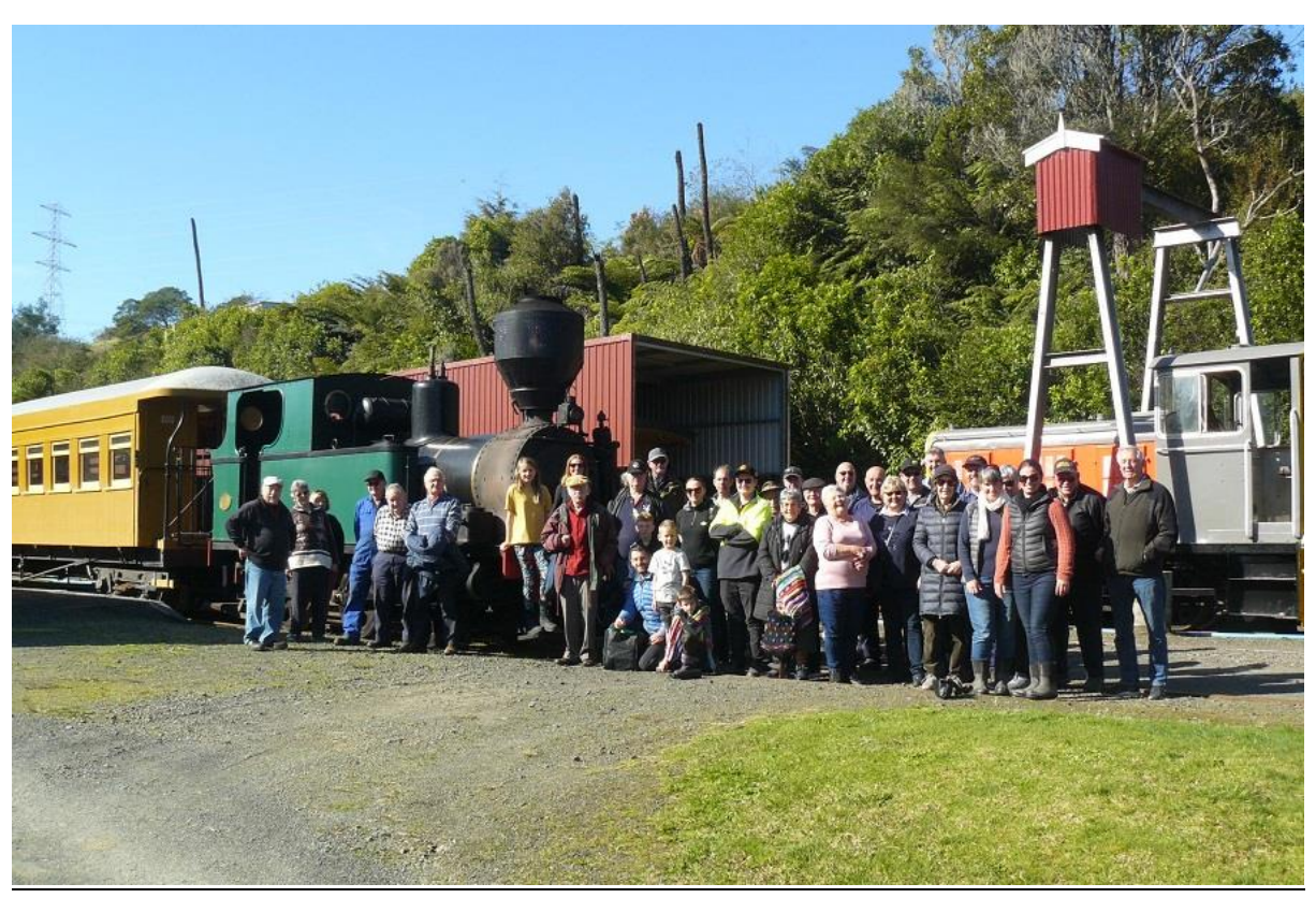
Members of the Tauranga Model Marine & Engineering Club were at a recent BTC charter