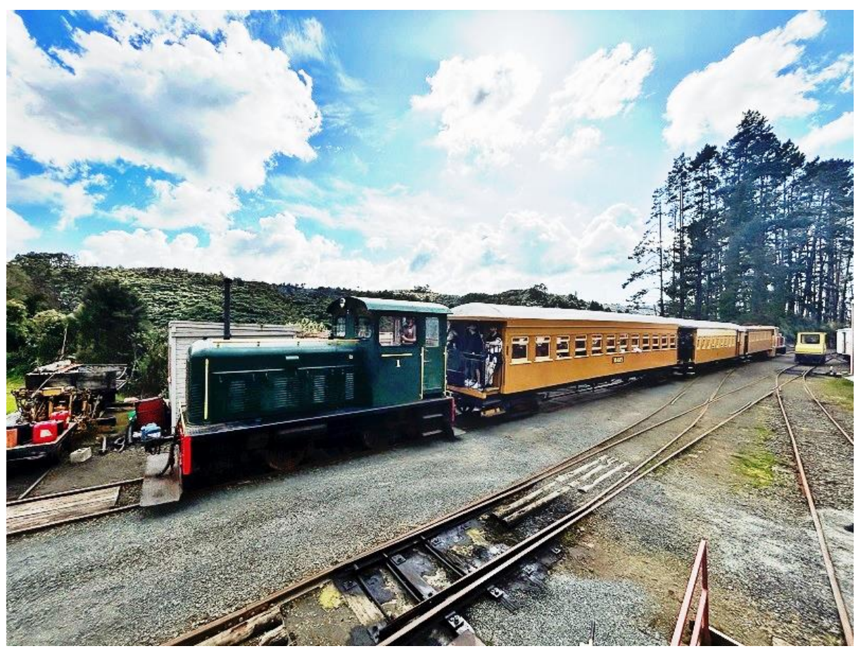
Two diesels and 3 carriages - an uncommon sight - seen at the August Open day