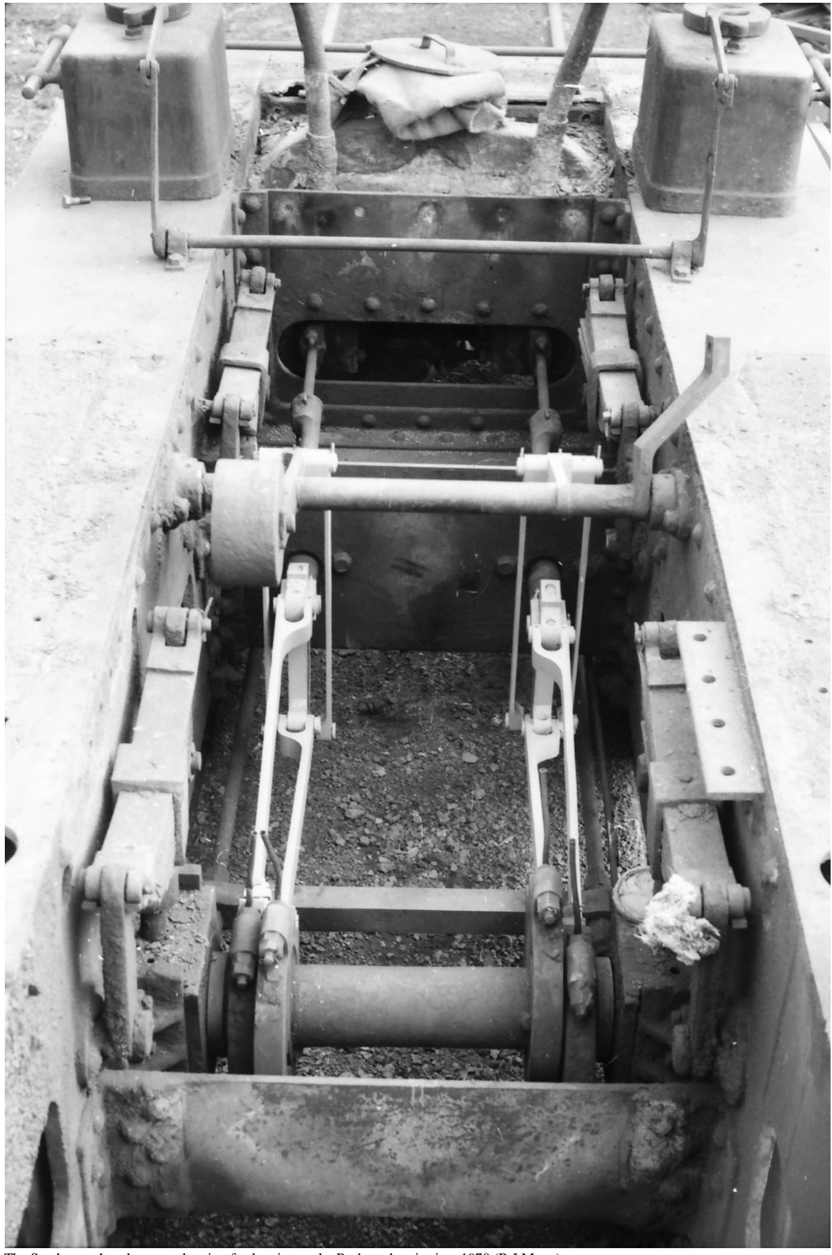
The Stephenson's valve gear showing fresh paint on the Peckett chassis circa 1970