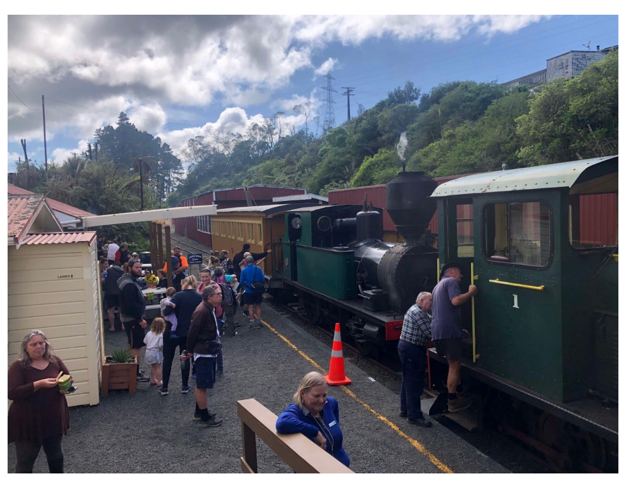
Scene at a recent Open Day

Thanks to all who turn up & help make these days a success.