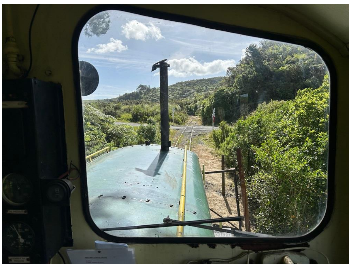
This view from one of our Meremere diesels shows the locality of the vandalism which has recently occurred to our security gate (C.Mann)

This is the second time the gate has been damaged in the last few months.