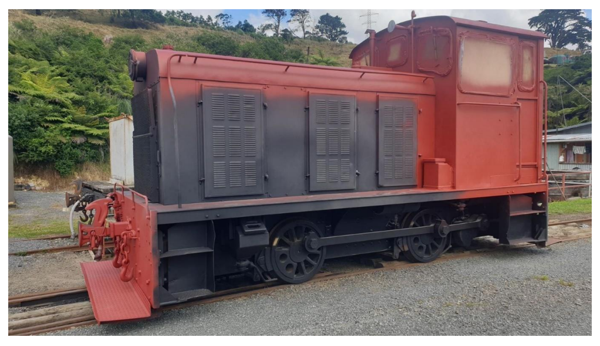
Tr459 seen here in primer after blasting (I. Jenner)