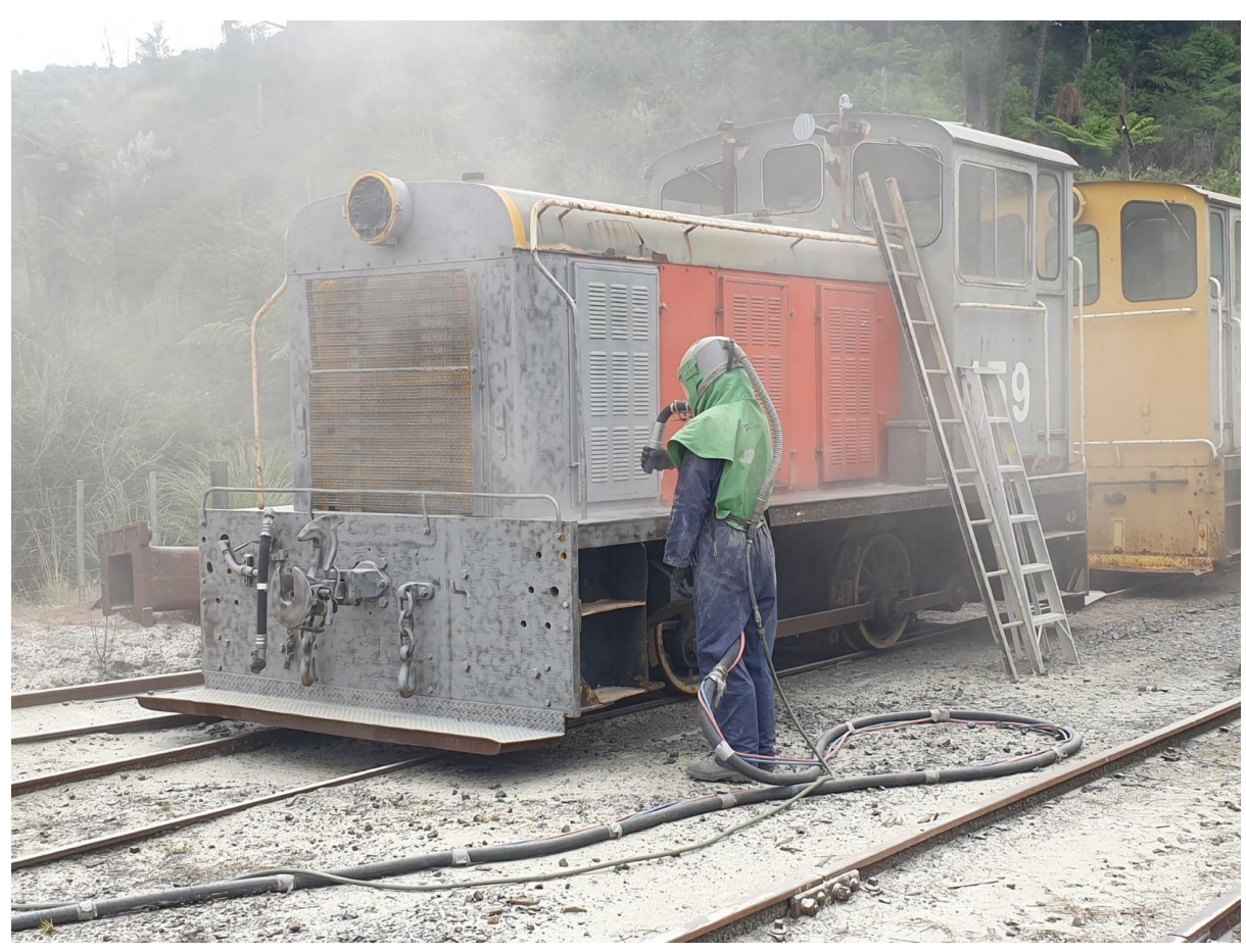
Tr459 gets blasted prior to painting

Diesel locos: Tr 459: This loco was glass blasted during the week of 6/2 & then a coat of under coat was sprayed on. Since then, the top coat has been started. Tr 436 is the next to be done.