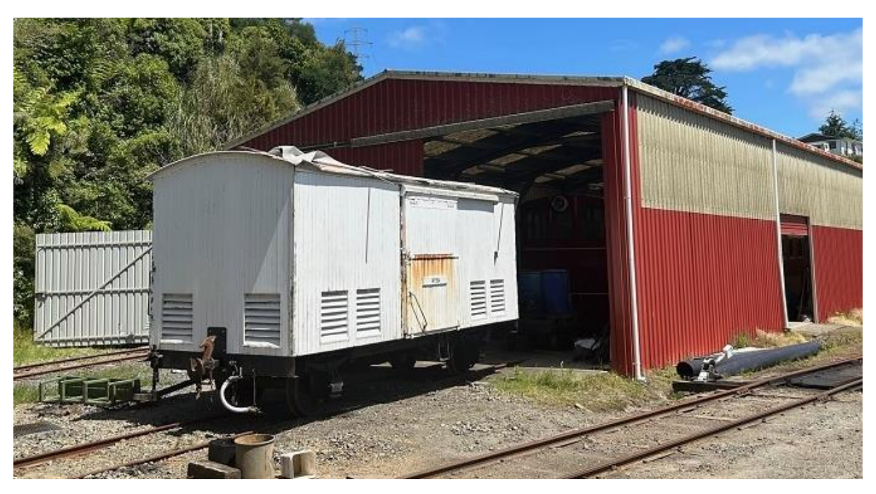
The box van outside the woodwork shop (C. Mann)