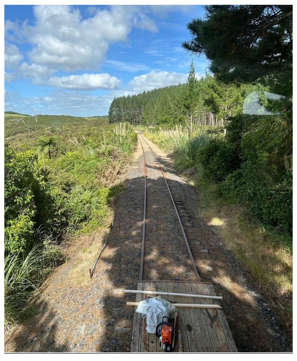
A clear view of our line, with the challenges of keeping the vegetation under control!