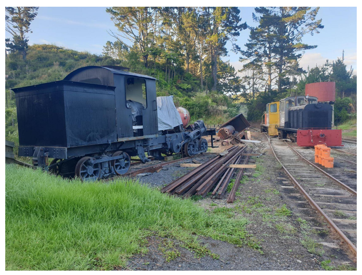
The Price "E" watches on whilst the Tr's get painted in primer at the top of the yard

Tr 105 was noticed during the February open day being driven up & down the yard.