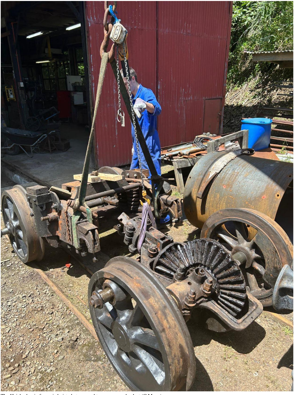
The Heisler bogie frame is hoisted at one end to remove a wheelset