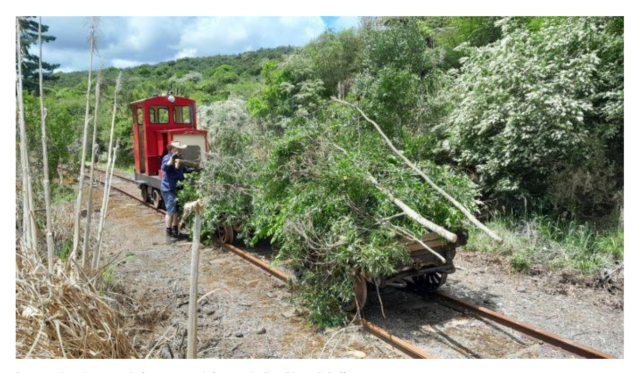
Pete attends to the removal of excess growth from up the line