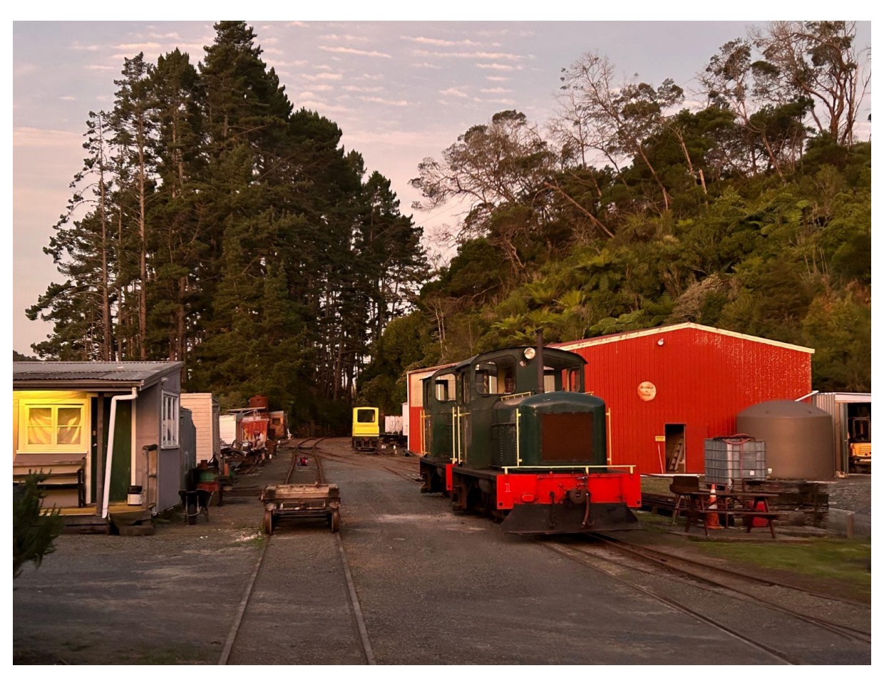
A view of the lower yard

Charter trips: We had a visit from an elderly group from Hamilton West & they really enjoyed their ride. We have another two enquiries but haven't heard from them for a while now.