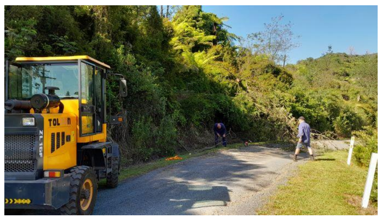
Clearing up the driveway