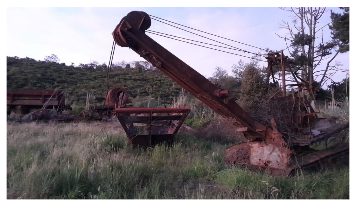
Rusting hulks in our "rotten row" triangle