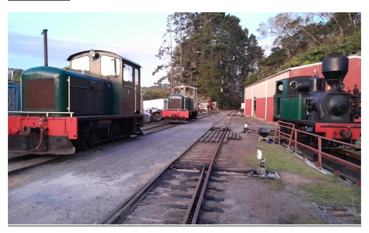
Most of our Open Day operating locos here seen at a recent Open Day in the lower yard (J. Soffe)